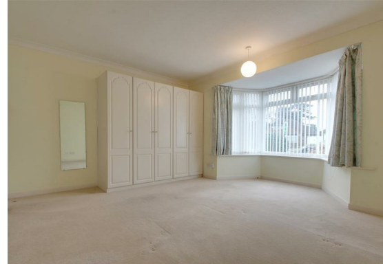
Bedroom one 15'3 x 10'10 (4.65m x 3.30m)